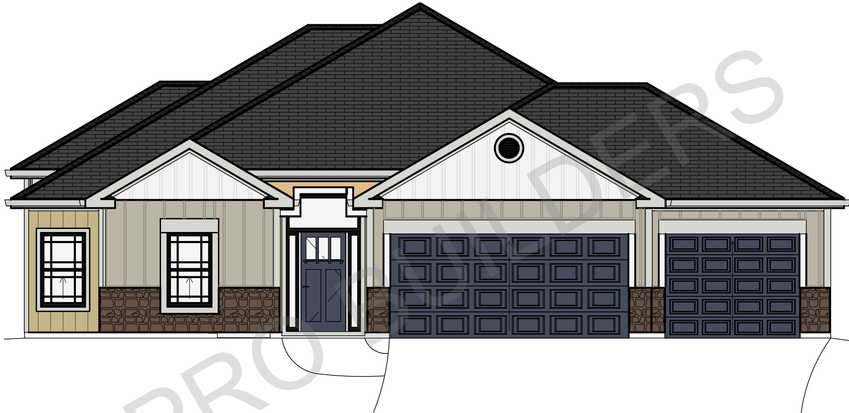
THE ALTENBURG BY: PRO BUILDERS