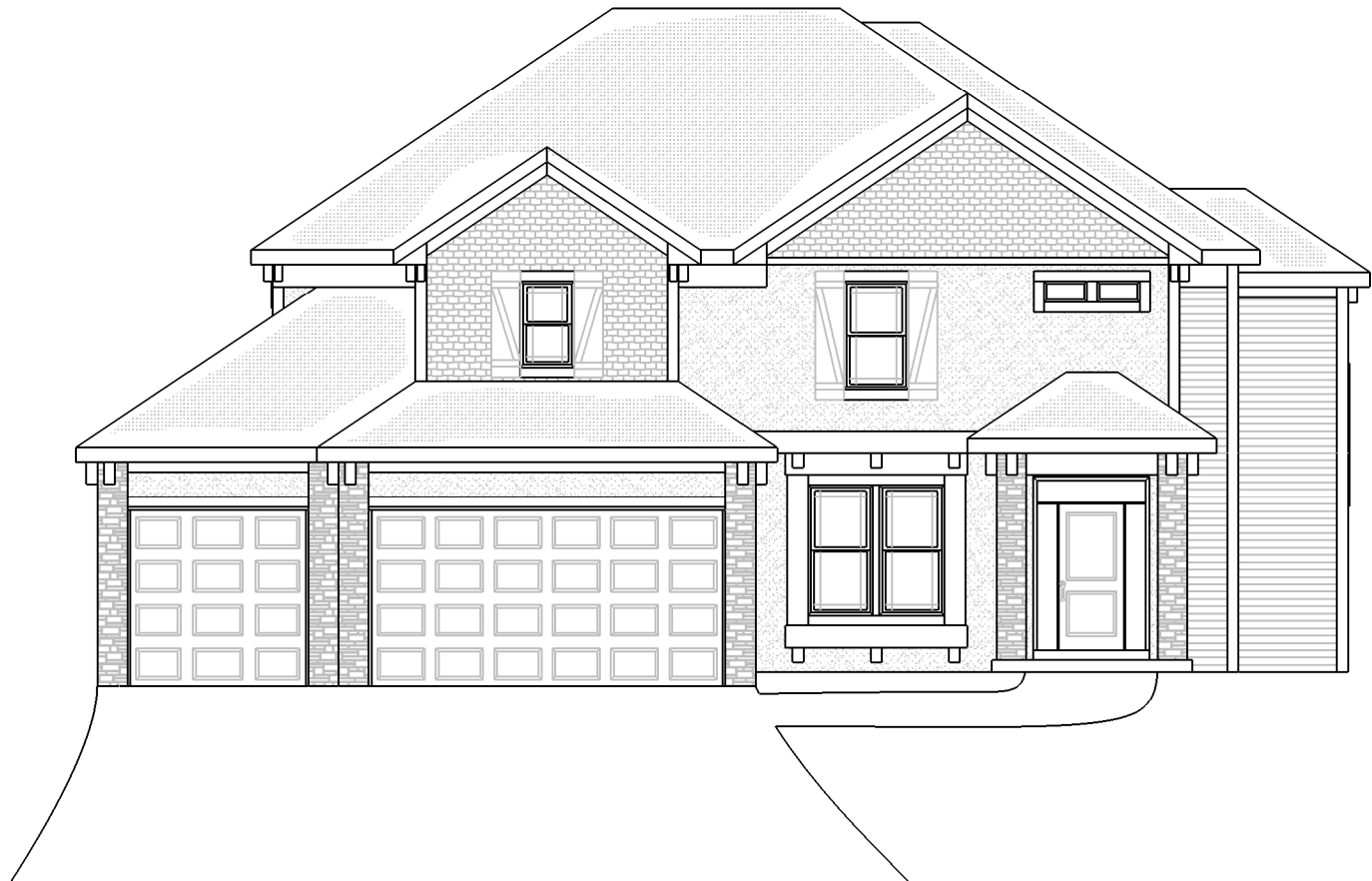
FRONT ELEVATION ELEVATION #2